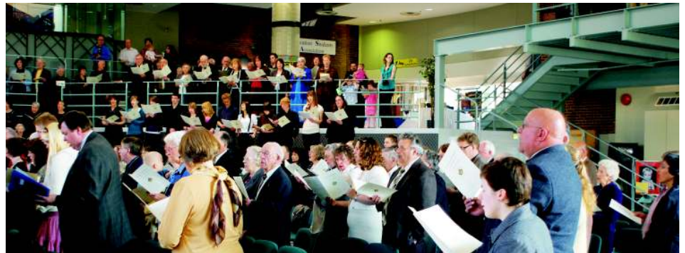
Some of the audience for the Sacred convocation; visitors came from across Canada