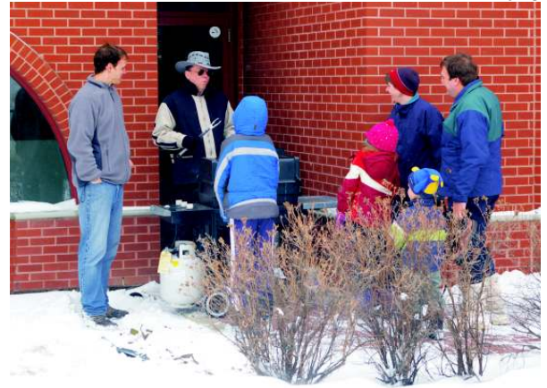
Seminary community gatherings include meals and celebrations like the "Spring" student year-end barbecue in the snow!